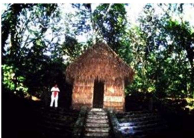
The shaman's hut.